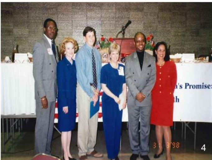
Leaders of the very first Northeast Louisiana's Promise Meeting held March 13, 1998